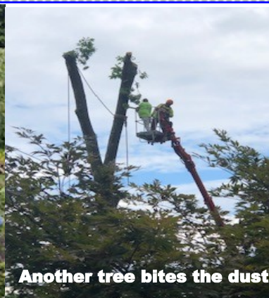
Another tree bites the dust