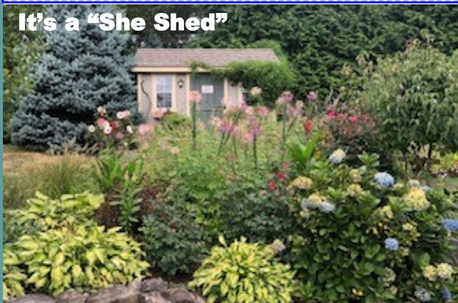
It's a "She Shed"